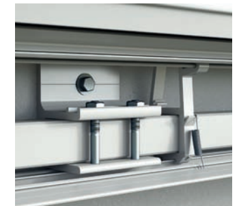
Left to right: 1. Concealed housing protects fabric & mechanics 2. Front bar with water drainage 3. Profile open 4. Detail square bar mounting bracket